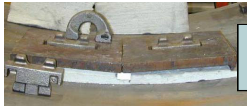
Liner system showing the cap and base detail

JAMMBCO Patented ECONOLINER SYSTEMS have many advantages over conventional castable linings when used in the chain area of the kiln.