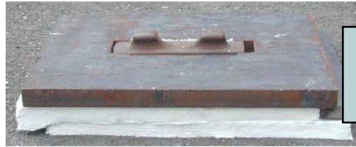
Liner plate and based showing fibre insulation